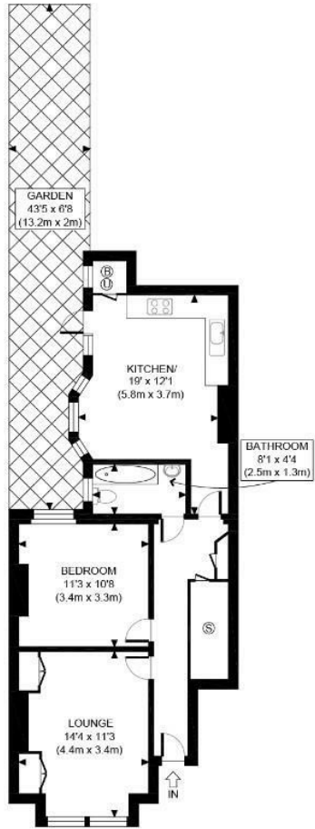
FIRST FLOOR GROSS INTERNAL FLOOR AREA 645 SQ FT